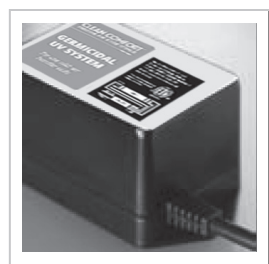
Energy efficient, low voltage, electronic ballast operates on only 24 volts and is moisture sealed for HVAC applications.