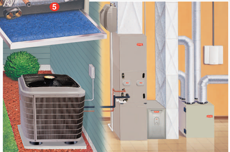
Heat Pump and Fan Coil System