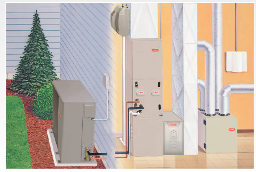
Compact Horizontal Heat Pump and Gas Furnace System