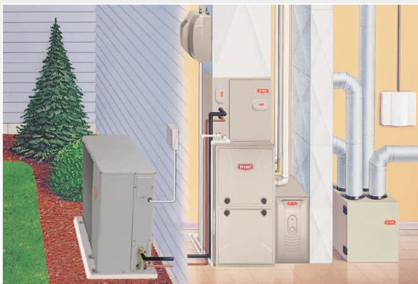
Compact Horizontal Air Conditioner and Gas Furnace System